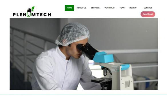
Figure 3.1 Implementation of Home Page(Screenshots)