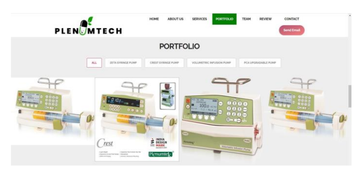
Figure 3.2 Product Gallery